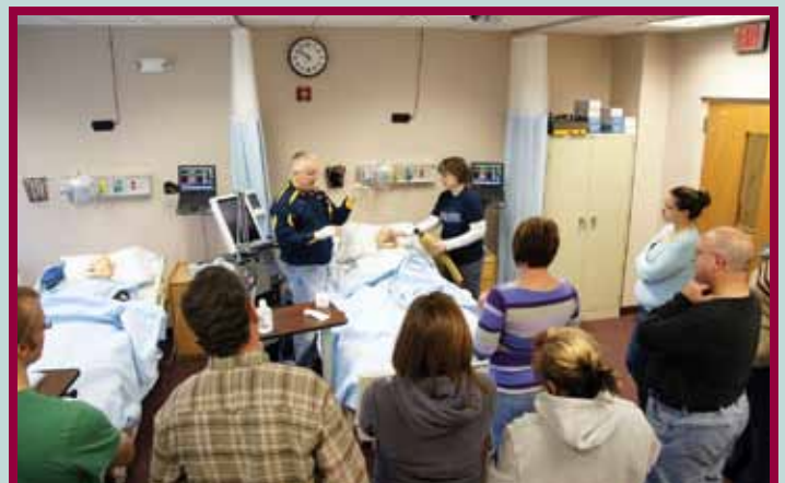
A Respiratory Therapy class utilizes WCC's Healthcare Simulation Laboratory.