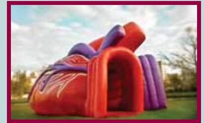
This inflatable heart was featured at a 2010 health fair.

public school systems with a focus on child health, along with assisting area agencies and organizations fulfill goals related to improving the health of the community. A health fair was held in June of 2010.