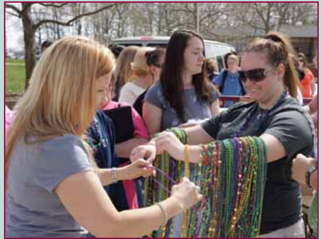
A student distributes Mardi Gras beads during the annual Spring Fling held at the college in April of 2010. The event included free food, activities, and entertainment for students, faculty, and staff.

Enrollment at the Crossroads Institute site has more than doubled from 52 "full-time equivalent" students during the college's Summer semester in 2005 to 131 "full-time equivalent" students during the Summer semester of 2009 when the college set a summer