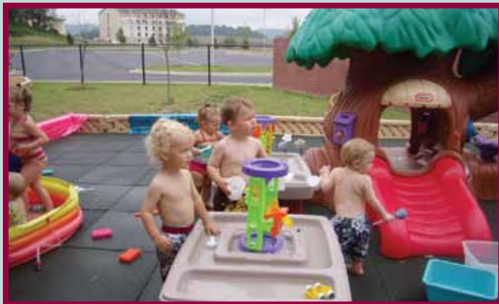
Children at the Child Development Center enjoy equipment bought by the W-B Foundation.

theville's Wellness Center. The trail will provide an instructional area for health and physical education programs offered through both WCC and the Town of Wytheville's Parks and Recreation Department. The trail is expected to be completed in 2011. The Wythe-Bland Foundation has provided $400,000 for this project.